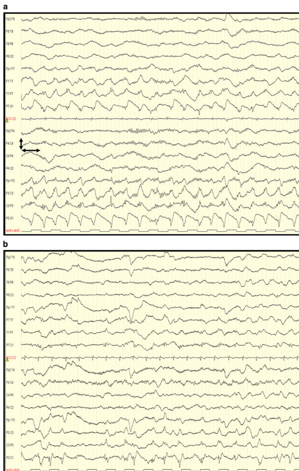
Fig. 2 a (case 2): EEG before magnesium infusion. Despite midazolam, levetiracetam, and phenytoin, there is an ongoing status epilepticus of the left hemisphere. b (case 2): EEG about 10 h after the start of magnesium infusion. There is a marked loss of rhythmicity and improved background over the left and right hemisphere. Left and right arrow 1 s; up and down arrow 200 \mu V

treatment of status epilepticus but resistance often develops over prolonged status epilepticus. Ketamine, which is also an NMDA-receptor antagonist, however, showed no effect when administered within the hour after onset of status epilepticus, but was effective in treating prolonged status epilepticus, suggesting a shift